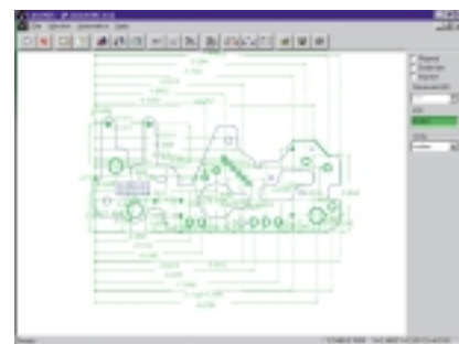
Eliminate your QC bottleneck Save time by generating a fully dimensioned Inspection Check Sheet in seconds with LaserQC and meet your customers' and your own internal quality requirements.